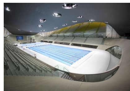
Aquatics Centre- Completed 27 July 2011 on time and within budget. This marked the 'one year' celebration until the Opening Ceremony