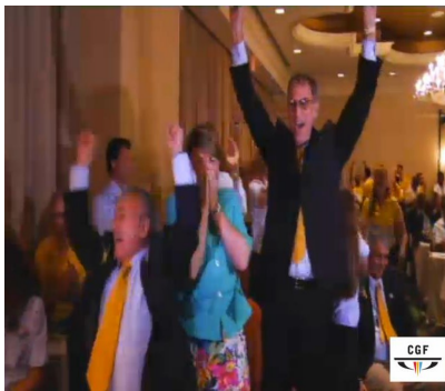
Members of the Gold Coast bid team celebrate immediately following the announcement

To learn more about the Commonwealth Games Federation visit www.thecgf.com