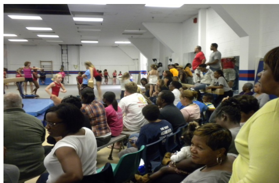
Family and friends of the gymnasts show their support by attending the meet on November 12th

The BOA would like to thank BGA for making us aware of this event!